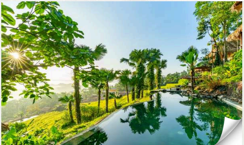
Boutique living with gourmet cuisine, infinity pools, spa, and stonework