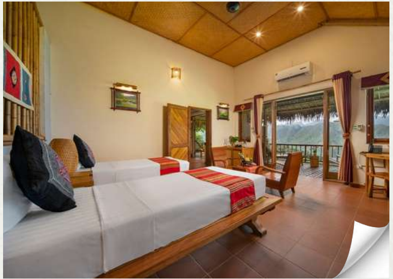
Traditional eco-design with authentic wooden bungalows